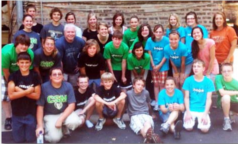
2010 Chicago Mission Team

This is why our students will remember the poor. Yes, they helped the poor and needy through serving and caring and loving as much as they could, but helping is momentary and often limited. To remember the poor is to constantly orient your life in a way that honors and reflects what you have learned and experienced with the poor and needy. Our students do not want to forget how they have changed and grown from this experience. Thank