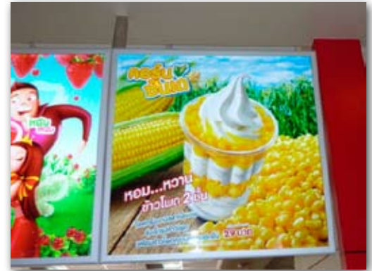
Would you like a Corn Sundae...?

Everyone asks if we like the food. Every day Don eats Thai food along with the whole plant staff because in Thailand all workers are offered a ride to and from work and a lunch time meal. He is adjusting to the heat, maybe one day he will enjoy it. (Don's project is running a little behind due to equipment deliveries and a few other things, but it will be a very nice factory when it is completed.) We have tried several new dishes: the fish ball dish was deliciously seasoned, palm seed has a delightful flavor, and the corn sundae at KFC was surprisingly good. We have yet to try snake head soup. We're saving this delicacy for visiting friends and family.