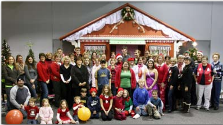
Candy Cane Project Volunteers in front of the Gingerbread House.

and Muscatine Center for Strategic Action. Their goal was "Spreading Christmas Joy to Muscatine Children in Christ's Name," and it didn't take long for the project to be embraced by friends and families in a number of Muscatine churches, including Calvary, St. Mathias, Mulford E-Free and First Baptist Church. This year's list of 175+ children's names was eagerly distributed, and the women found